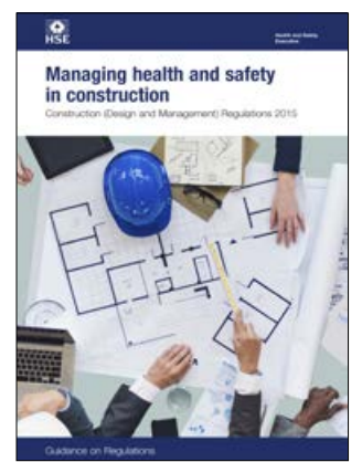
L153 Published 2015

The Construction (Design and Management) Regulations 2015 (CDM 2015) came into force on 6 April 2015, replacing CDM 2007. This publication provides guidance on the legal requirements for CDM 2015 and is available to help anyone with duties under the Regulations. It describes: